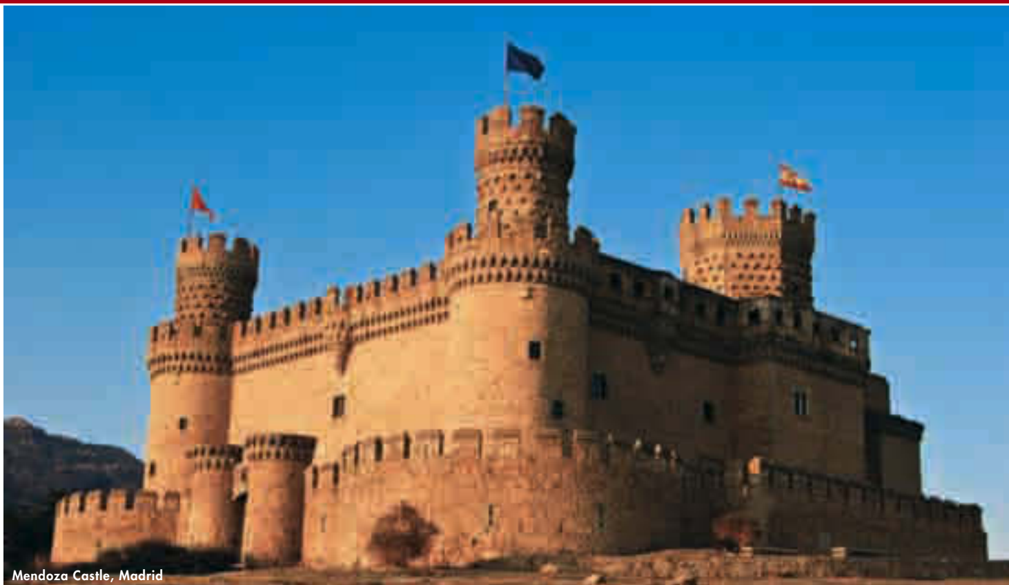
Mendoza Castle, Madrid

The introduction of the AVE High Speed Train to Spain had changed the face of Independent Travel within the Iberian Peninsula. Today, visitors to Spain can travel between major cities, in comfort and speed (up to 186 mph) and without the hassle of crowded airports, delays and long drive. To complete your experience, the Private Transfers to and from the train stations are included in your program as well as a Private Guide for each of the mentioned sightseeing.