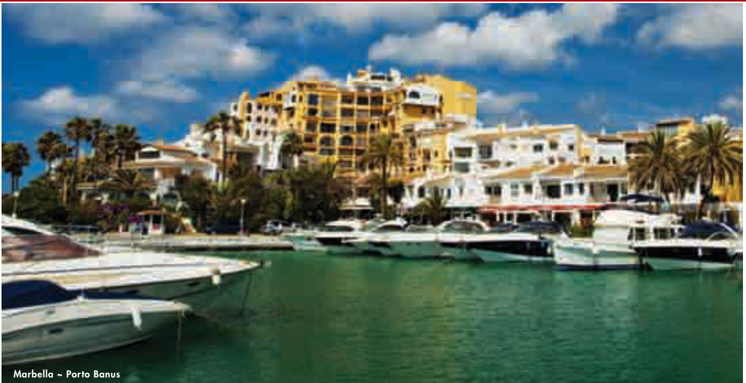
Marbella ~ Porto Banus

MALAGA , the second largest city in Andalucia is also one of the oldest cities in the world, spanning 2700 years. The archaeological remains and monuments from the Phoenician, Roman, Arabian and Christian eras makes for a fascinating historic center, rich in artistic heritage. Birthplace of Pablo Picasso, Malaga now boasts the new Museo Picasso displaying works of the native artist. Situated in the warmest region of Europe, it has much to offer including the famous Andalucia gastronomy.