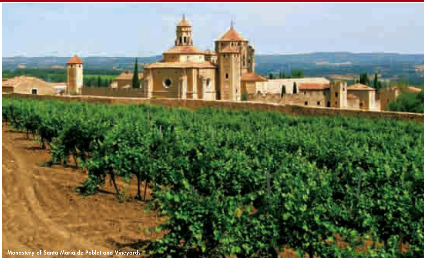
Monastery of Santa Maria de Poblet and Vineyards