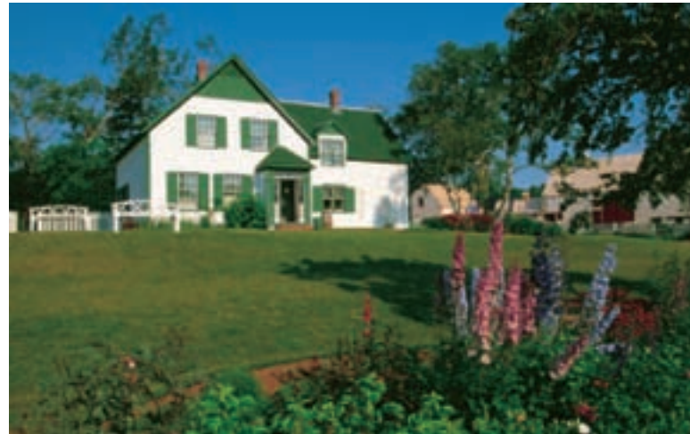
Anne of Green Gables home

We leave this beautiful coastline region of Canada with memories to share with family and friends. Your Tour Manager will arrange your transfer to the airport in Halifax for flights home anytime today. Breakfast