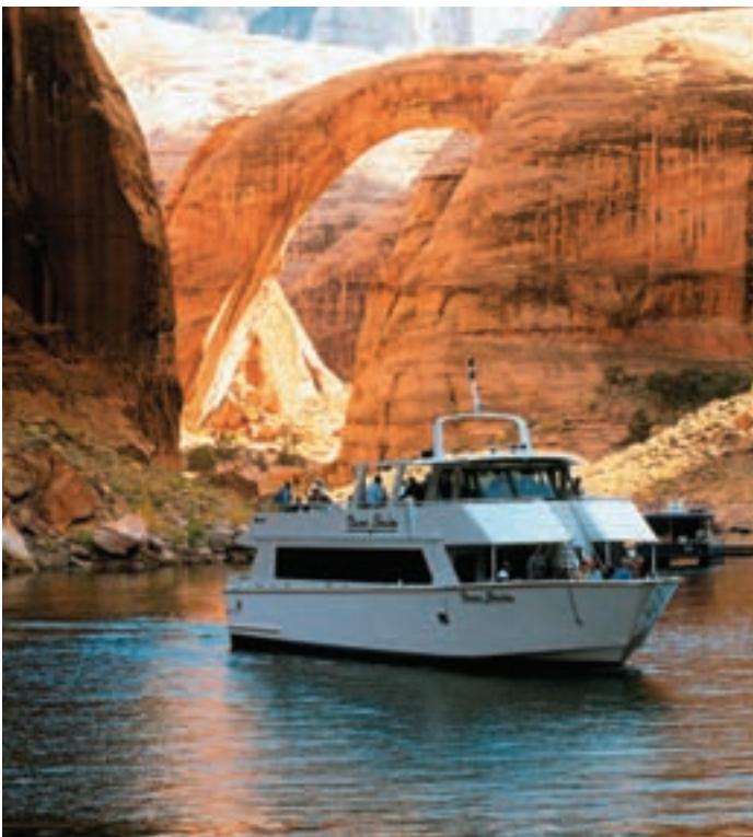
Cruise Lake Powell

This morning we travel into the Navajo Indian Reservation where you get a feel for the Old West. After lunch, a Native American Guide will describe the fascinating history of this scenic region. In Monument Valley we pass sandstone monuments that rise more than 1,000 feet in vertical splendor. Breakfast and lunch