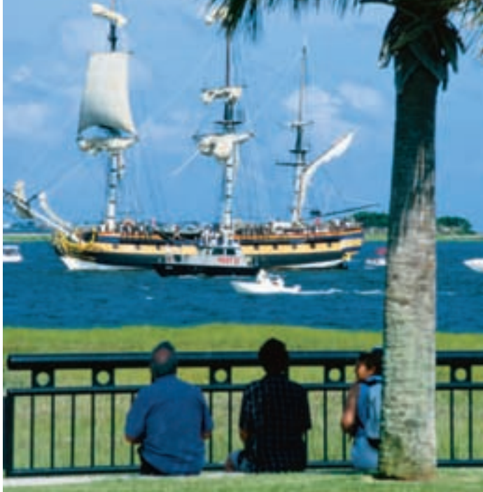
Historic Charleston Harbor

homes. Late this afternoon we arrive at the romantic Victorian-style Jekyll Island Club Hotel, our home for the next two nights. The Jekyll Island Club was originally built as an exclusive island getaway for the Rockefeller and Vanderbilt families.