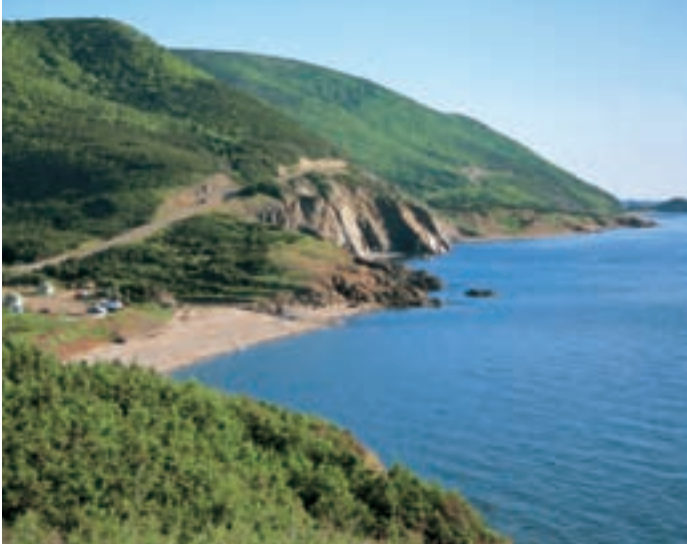
Scenic Cabot Trail

French and Scottish settlements nestled below the mountains resembling the highlands of Scotland. We'll enjoy a relaxing picnic lunch along the way as we experience the scenic nooks and crannies of this remarkable landscape. Breakfast and box lunch