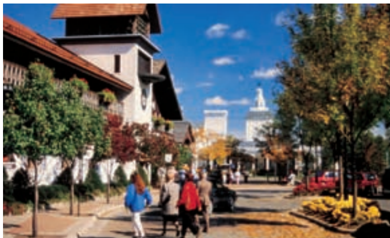
Autumn in the Bavarian town of Frankenmuth

Our journey ends with a transfer to the airport in Chicago for flights home after 5:00 p.m. Breakfast