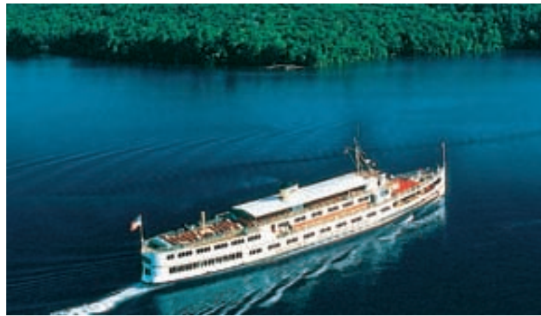
Lake Winnepesaukee Cruise

Today we make our way south on our included group transfer to Boston's Logan Airport for flights out after 5:00 p.m. Breakfast