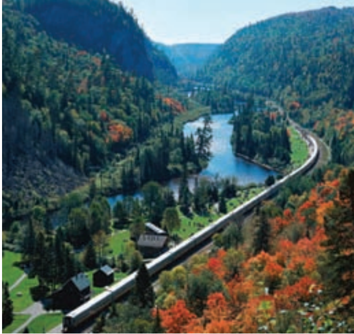
Agawa Canyon Autumn Foliage Train

ments and music-making machines, from 1870 through 1930 at the Music House Museum. Nickelodeons, music boxes, pipe organs and a Belgian dance organ come alive. Breakfast