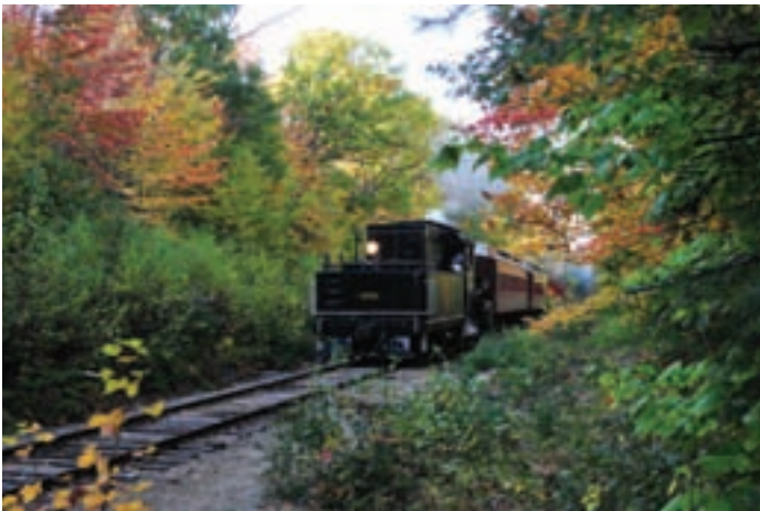
Conway Scenic Railroad

This afternoon we follow the Kancamagus Scenic Byway as it follows a beautiful path through the White Mountains. It is one of the world's most spectacular autumn foliage trips, where a stunning spectrum of color underscores the region's natural beauty year round. The road meanders through vast forests, old logging roads, and Indian hunting paths. Later, we board the Conway Scenic