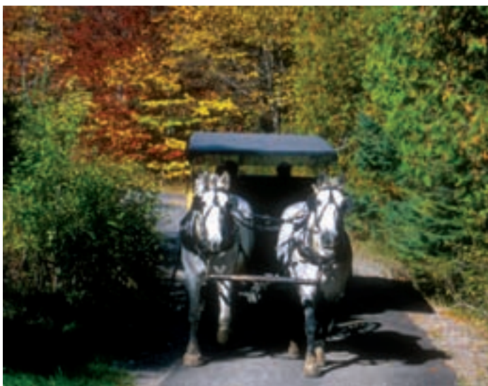
Horse-drawn carriage in Mackinac Island

A trip to Mackinac Island is like a trip back in time. From its bluff cottages to its quaint horse-drawn carriages (no cars are allowed on the island), this peaceful resort island offers a glimpse into life during a simpler and more genteel era. Upon arrival, we tour the Island via horse-drawn carriage and step back in time as you enjoy the atmosphere of this unique treasure. At the end of the tour, the carriage brings us to the crown jewel of Mackinac Island, The Grand Hotel, the world's largest summer hotel, built in 1897, and our home for the next two nights. Breakfast and dinner