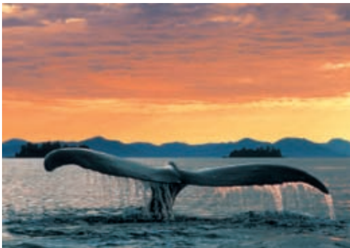
Experience the Grandeur of Alaska

Arrive in Vancouver early this morning and prepare for your motor-coach transfer to the airport in Seattle for flights home after 2:00 p.m. Return home with a new appreciation of Alaska's mountain spires, mighty rivers and glaciers. Breakfast on board