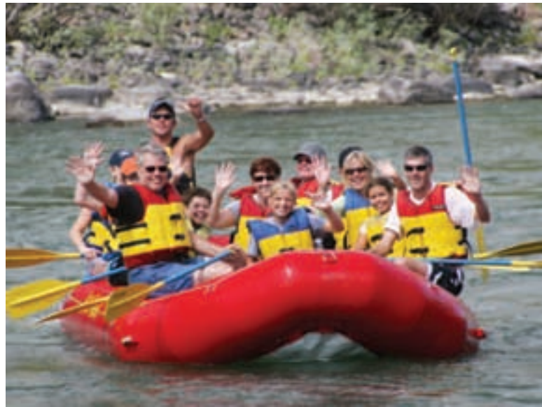
Float trip on the Colorado River