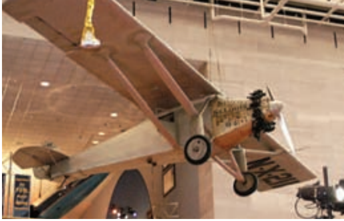
Spirit of St. Louis, Smithsonian Air & Space Museum

largest museum complex and research organization. Composed of 16 museums in Washington, DC, the Smithsonian's exhibits offer visitors a glimpse into its vast collection. Numbering over 142 million objects the complex includes the Air & Space Museum and the National Museum of the American Indian. Some of the famous exhibitions include Lindbergh's Spirit of St. Louis and the command module from Apollo 11 .