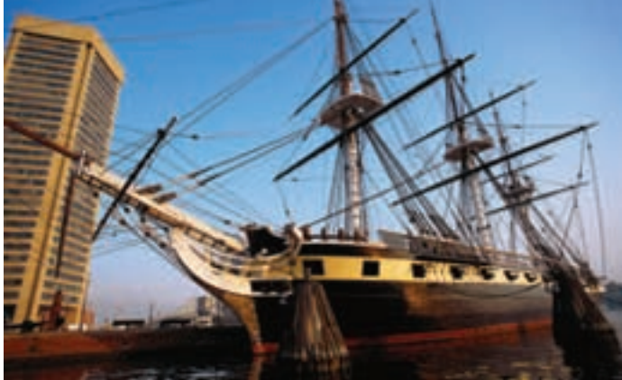
USS Constitution, Boston