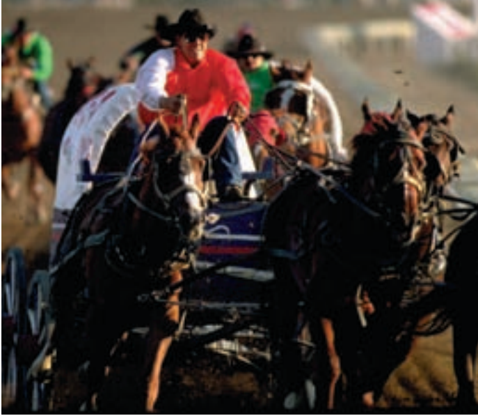
Chuckwagon Races at the Calgary Stampede

and Peyto Lake, come into view. See snow-capped mountains reflected in the turquoise waters of Moraine Lake and watch for black bear, moose and caribou along the way. Dinner