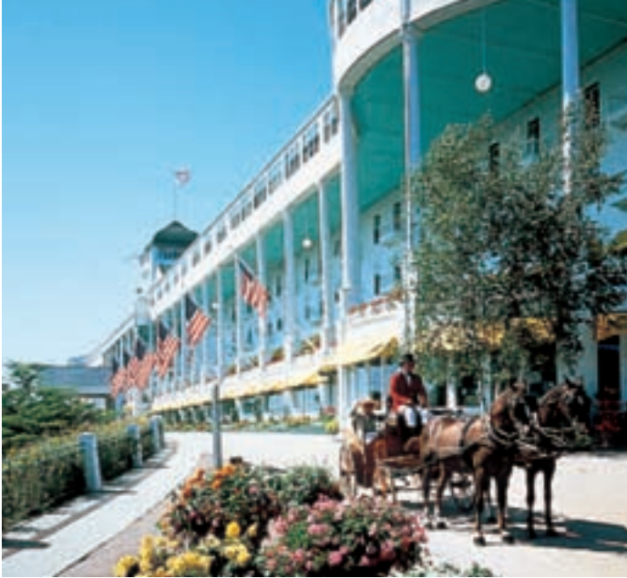
The Grand Hotel, Mackinac Island

and an antique carousel with hand carved wooden horses and beautiful paintings. You will have time available to explore Holland on your own. This afternoon we have reserved seating at the Muziekparade (Music Parade), where local and national marching bands, floats, giant helium balloons, Dutch Dancers and more participate to the delight of young and old alike. Breakfast