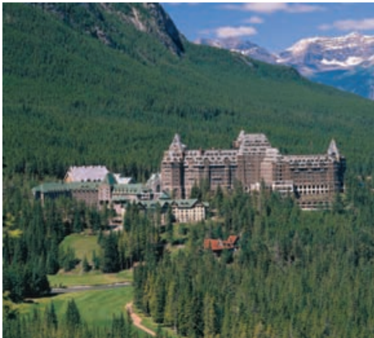
The magnificent Banff Springs Hotel

Following breakfast, we depart Banff on a group transfer to Calgary for flights home after 1:00 p.m. Breakfast