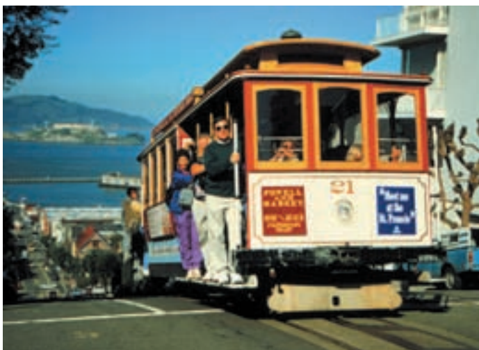
Famous San Francisco cable car

Begin the day in Malibu with breakfast on the coast. Framed by the Pacific Ocean and the Santa Monica Mountains, Malibu is home to countless movie stars and has been called "27 miles of scenic beauty." A local guide then takes us on a journey through some of the famous sights of Los Angeles, Beverly Hills and Hollywood. Breakfast