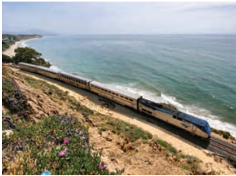
Amtrak's Coast Starlight

Today bid farewell to your newfound friends and take home memories of the sights and sounds of California's coast. There will be one group transfer to Los Angeles International Airport for flights home after 11:00 a.m. Breakfast