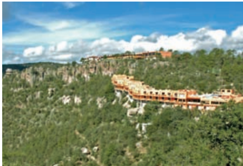
Spend 2 nights on the Rim of the Copper Canyon

Following breakfast, say goodbye to the southwest with a transfer to the Tucson airport for flights home. Breakfast