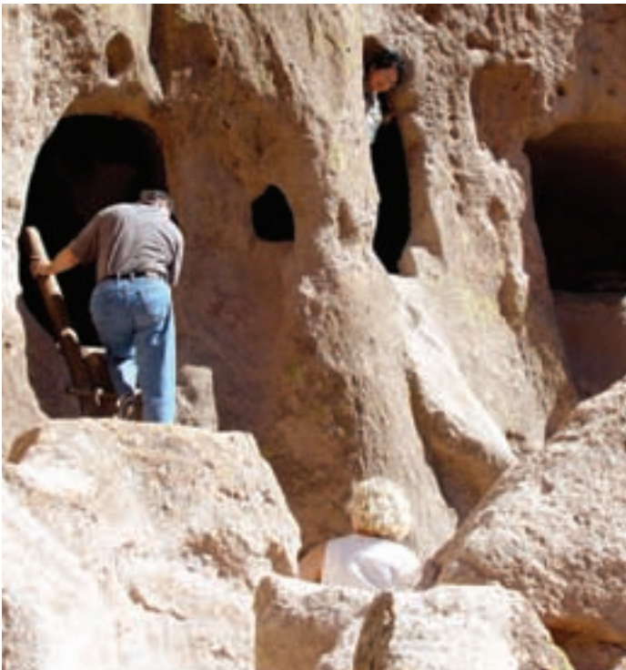
Bandelier National Monument

This morning we are off to Los Alamos via the Jemez Mountain Trail to visit Bandelier National Monument. Here you can see the display of daily life of the Pueblo people and their traditions, which began in the distant past and are still practiced today. Breakfast