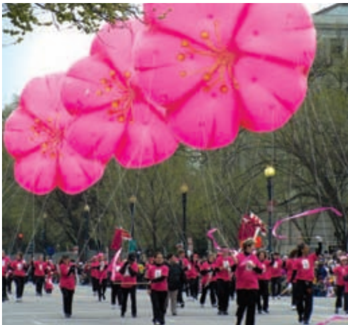
Enjoy the Cherry Blossom Parade

No tour of colonial America is complete without a stop at Mount Vernon, the expansive estate of George and Martha Washington. Visit the Ford Orientation Center and the Donald W. Reynolds Museum where you will have the chance to experience Washington's life through movies and exhibitions. Explore his mansion filled with 18th century treasures and stroll the gardens