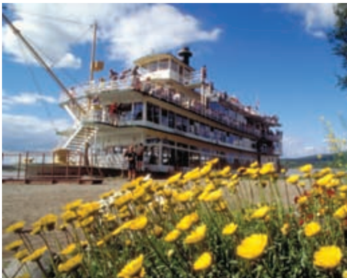
Riverboat Discovery on the Chena River

There is time this morning to explore the beauty and wonder of Denali National Park on your own or you may wish to take an optional excursion. Imagine yourself soaring above the trees on an exciting helicopter flightseeing trip in search of wildlife, or leisurely floating along the Nenana River on a river float trip. In the after-