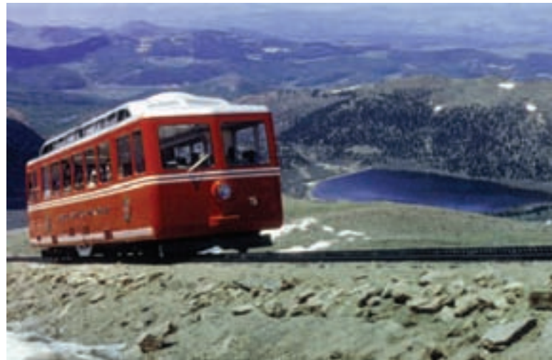
Pikes Peak Cog Railway

Following breakfast we say goodbye to Colorado with fond memories of our western railroads adventure with a group transfer to the Denver International Airport for flights home after 12:00 p.m. Breakfast