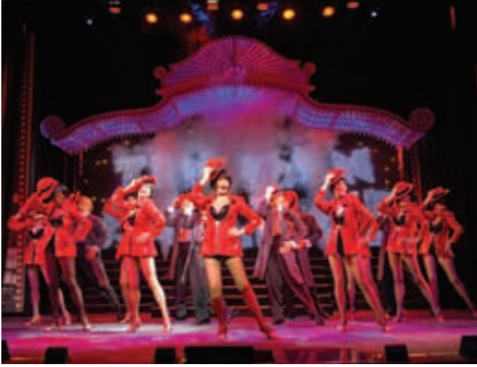
Palm Springs Follies