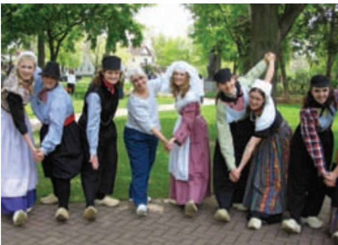
Experience the Tulip Time Festival in Holland, Michigan