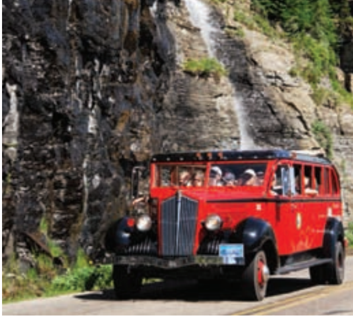
Tour Glacier National Park in a "Jammer"