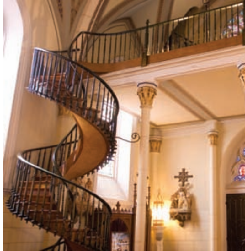
The Miraculous Staircase of Loretto Chapel

Transfer to Albuquerque's Sunport Airport for flights home departing after 12:00 p.m. Breakfast