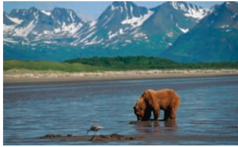
Denali National Park