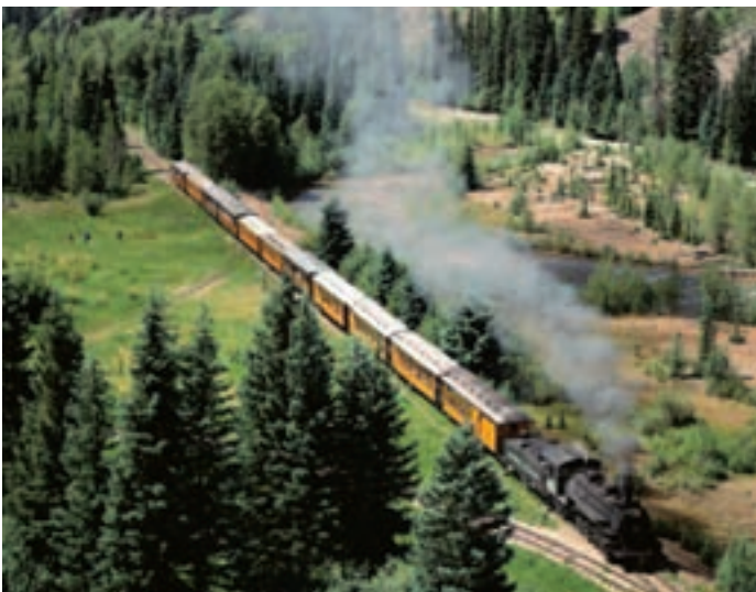
Durango & Silverton Narrow Gauge Railroad

Today we enjoy another journey by train aboard the Royal Gorge Railway. The 12-mile route follows the most famous portion of the old Denver and Rio Grande Western train line. We ride through the “Grand Canyon of the Arkansas” on an unforgettable journey over the famous Hanging Bridge, which clings precariously to the steep granite walls of Royal Gorge. Breakfast