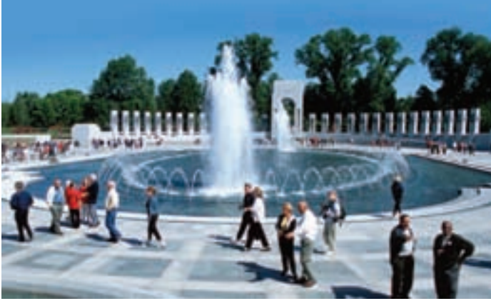
National World War II Memorial

largest museum complex and research organization. Composed of 16 museums in Washington, DC, the Smithsonian's exhibits offer visitors a glimpse into its vast collection. Numbering over 142 million objects the complex includes the Air & Space Museum and the National Museum of the American Indian. Some of the famous exhibitions include Lindbergh's Spirit of St. Louis and the command module from Apollo 11 .