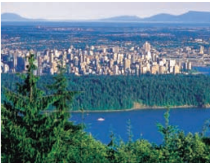
Vancouver and Stanley Park

This morning we board British Columbia's BC Ferry service for the ride across the Strait of Georgia to beautiful Vancouver Island. Back on our motorcoach, we visit the world-famous Butchart gardens. Ranked as one of the world's premier floral show gardens, Butchart