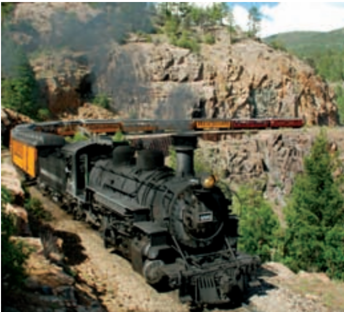
Durango & Silverton Narrow Gauge Railroad

Today we ride the original Rio Grande Line over the Rockies aboard the Cumbres & Toltec Scenic Railroad. This is America’s most spectacular narrow gauge steam railroad and it explores 50 miles of wild and rugged territory between Chama, New Mexico, and Antonito, Colorado. We will travel through Cumbres Pass, the highest point on the railroad and enjoy lunch at Osier. Here you can imagine what the region was like when the gold and silver miners as well as the loggers traveled the same route long ago. Breakfast and lunch