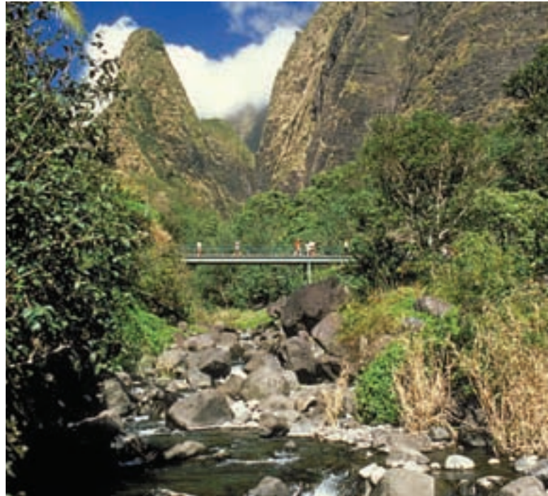
Maui’s Iao Valley