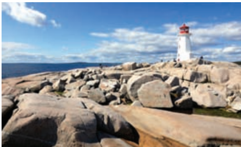
Peggy's Cove Lighthouse

The Carnival M/S Glory sails into New York harbor where a group transfer to New York's LaGuardia Airport has been arranged for flights departing after 2:00 p.m. Breakfast on board