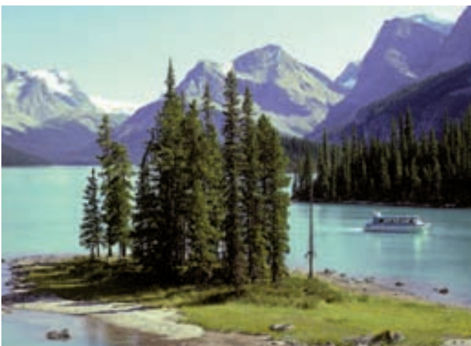
Cruise Maligne Lake

This morning it's on to Banff, Canada's first National Park. Located amid the rugged alpine beauty of the Rocky Mountains, Banff is a UNESCO World Heritage Site. We trade in our motorcoach for a "snocoach" and venture on to North America's largest glacier, the Columbia Icefield's Athabasca Glacier. You will travel in a specially designed vehicle to the middle of the glacier, as your driver points out interesting geological features. At the icefall below the glacier headwall, step out onto ice formed from snow which fell as long as 400 years ago. Savor magnificent views of the region as we continue along the parkway to the town of Banff. Breakfast