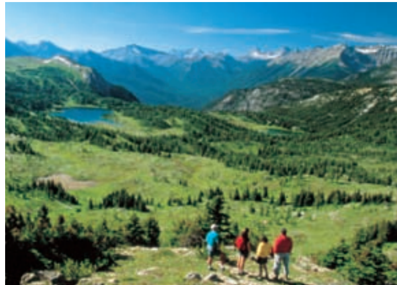
Banff National Park

Following breakfast, we depart Banff on a group transfer to Calgary for flights home after 1:00 p.m. Breakfast