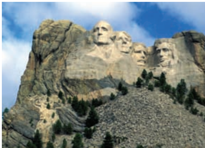
Mt. Rushmore, South Dakota

After a final morning in Rapid City, transfer to the airport for your flight home. Breakfast