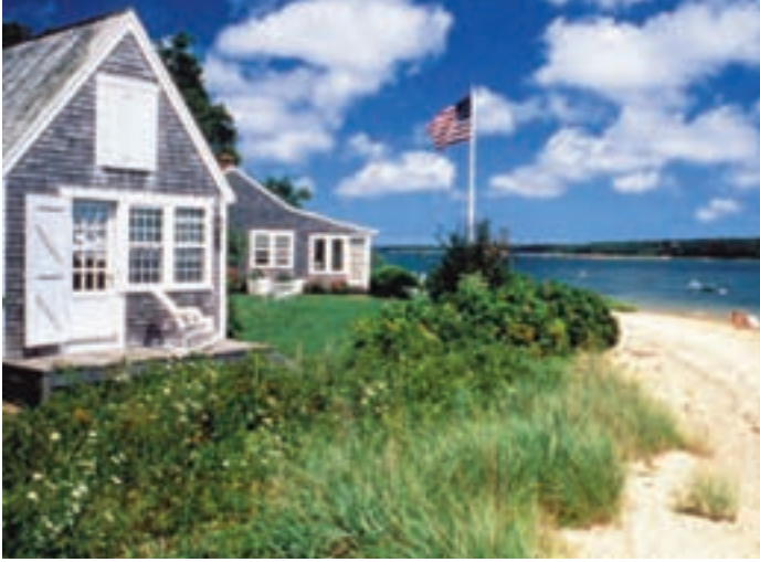
Quaint Martha's Vineyard