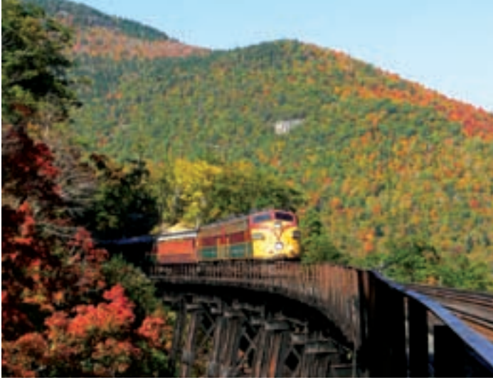
Conway Scenic Railroad