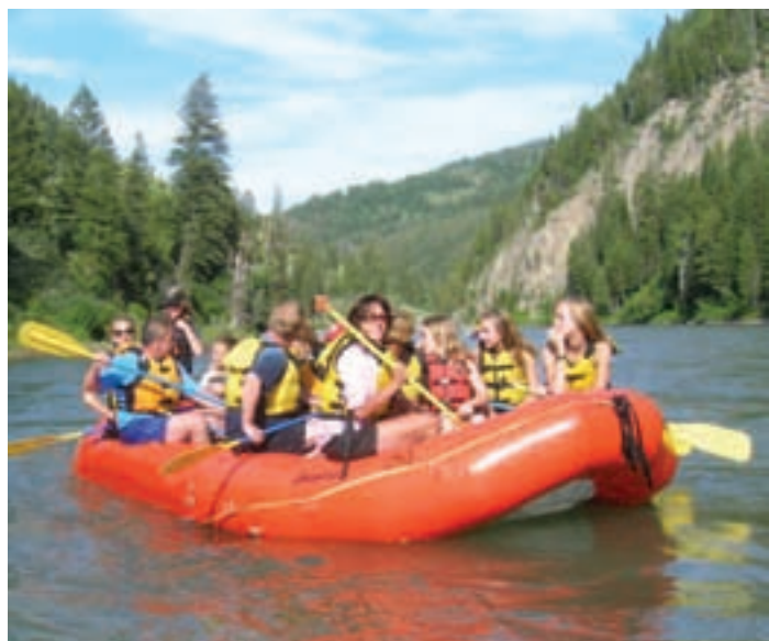
Float trip down the beautiful Snake River

Approaching the Black Hills, catch a glimpse of Devils Tower in the distance. This looming monolith served as the backdrop for the classic Steve Spielberg film Close Encounters of the Third Kind . At Deadwood, the famed OK Corral is where Wyatt Earp and his men took their legendary stand. At the historic cemetery of Boot Hill, Deadwood preserves the traditions and lore of the Old West. From its 19-century casinos to its museums, this historic mining town offers a glimpse into the lives of gamblers and gunslingers who once strolled these famed streets. Dinner