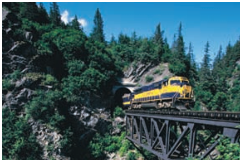
Ride the Alaska Railroad

Today we say good-bye to Alaska, the land of mountain peaks, mighty rivers and spectacular glaciers with a group transfer to the airport in Fairbanks.