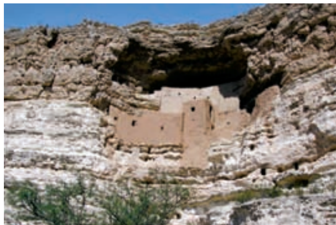
Montezuma Castle National Monument

Our Arizona adventure begins as we arrive in Phoenix and are transferred to “Old Town” Scottsdale. Old Town is the southwest’s premier art center where quaint Western-style streets are brimming with galleries, specialty shops and restaurants. Tonight, join your Tour Manager and meet your traveling companions at 6:00 p.m. in the hotel lobby for a get-acquainted dinner. Dinner