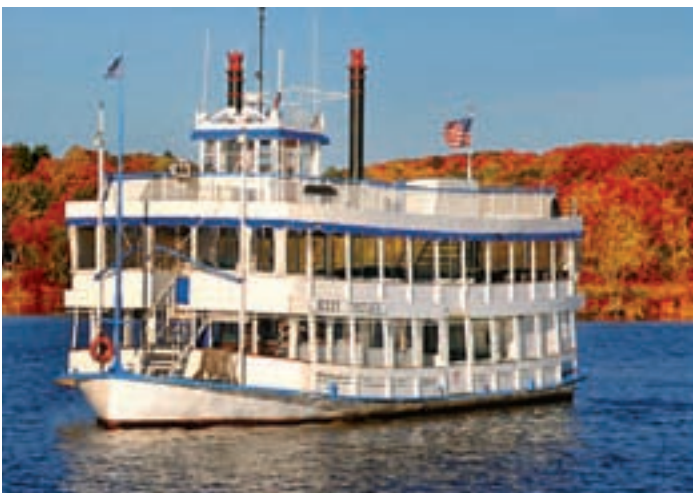
Riverboat Becky Thatcher

The Valley Railroad Company operates the coal-fired locomotives of the Essex Steam Train. Be swept away by the hiss of steam and the blast of the whistle as you pass through some of the most beautiful country in the state. See forests and streams, beautiful vistas and nostalgic towns. At Deep River Landing, you board the riverboat Becky Thatcher for a relaxing ride up the Connecticut River, before continuing to Cape Cod. Breakfast