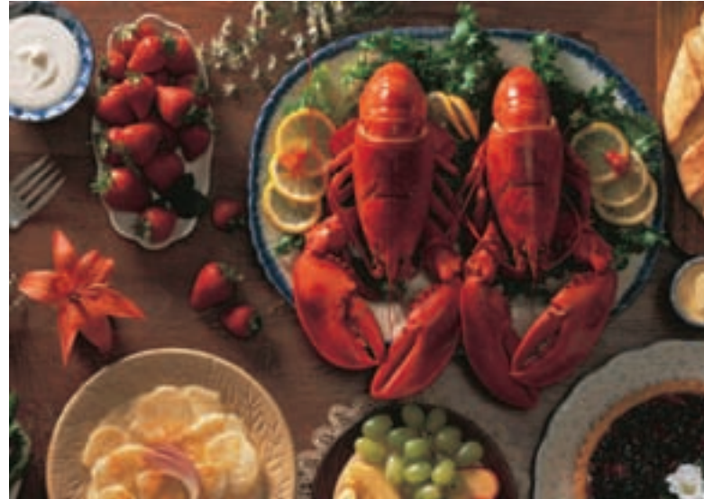
Enjoy a Lobster Dinner

After breakfast, you will have some free time to explore Hyannis. Your included group transfer to Boston's Logan Airport will be for flights out after 4:00 p.m. Breakfast