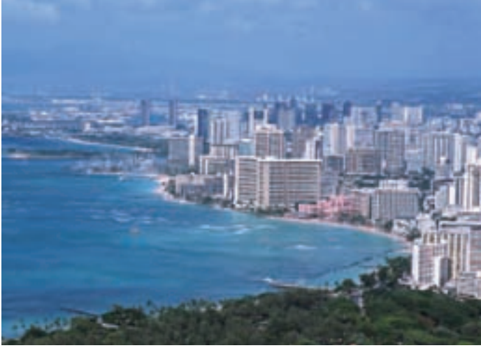
Honolulu as seen from atop Diamond Head