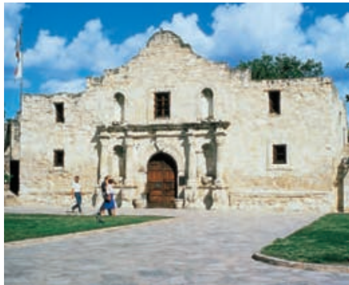
Visit the Alamo

Enjoy your morning at leisure. Your Tour Manager will assist you with transfers to the airport for flights home today. Breakfast