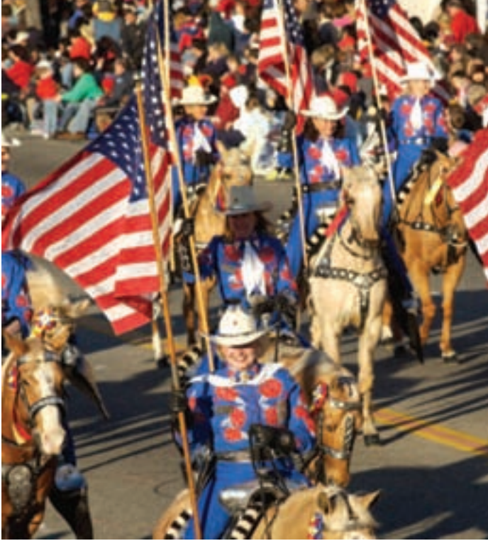
The 123rd Tournament of Roses Parade