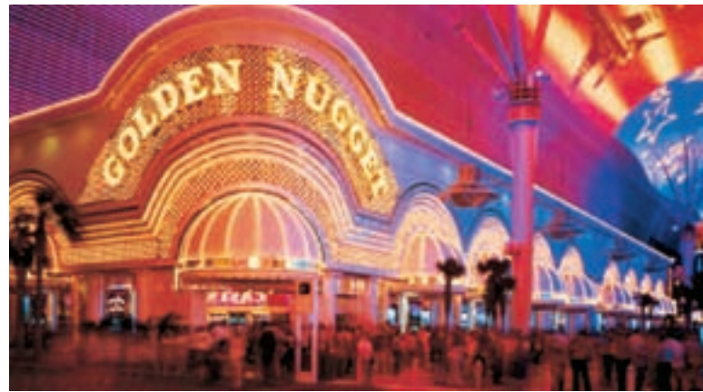
Our hotel in Las Vegas

After breakfast, transfer to Las Vegas McCarran International Airport for return flights. Breakfast