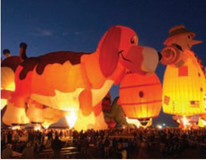
The brilliant colors of Balloon Glow