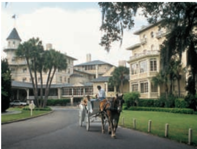
Jekyll Island Club

We travel to Savannah, the "Belle of the South" and discover why General Sherman found this city much too beautiful to burn during the Civil War. A local guide tells us the tales and secrets of the stately mansions as we drive through the Historic District. We pass the 1820 birthplace of Juliette Gordon Low, founder of the Girl Scouts, the squares and streets where movies such as Forrest Gump and Midnight in the Garden of Good and Evil were filmed. Breakfast