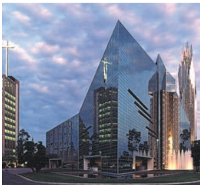
Witness The Glory of Christmas at the Crystal Cathedral

Go behind the scenes in Pasadena and watch as thousands of flowers from around the world are used to create the world's most imaginative floats. This evening, it's off to the world-famous Crystal Cathedral for a performance of The Glory of Christmas where the story and splendor of the original Christmas comes alive. Trumpets sound and angels rejoice overhead as the birth of Jesus comes alive during this inspirational performance. Breakfast