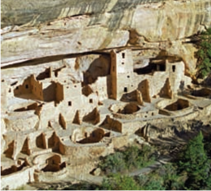
Mesa Verde National Park