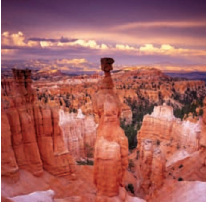
Multi-colored Bryce Canyon National Park