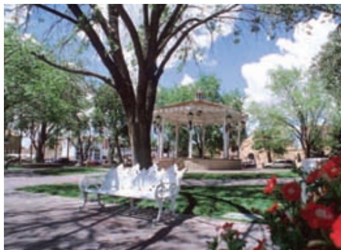
Old Town Albuquerque

Each October, the skies of New Mexico are painted with hundreds of balloons as they lift off from Fiesta Park. This evening, join your Tour Manager for an orientation at 6:00 p.m., followed by dinner. Dinner