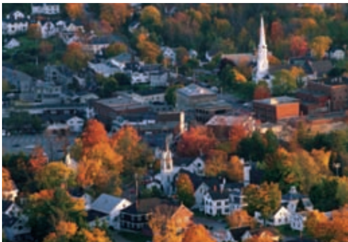
Autumn Foliage in New England

Today is free to enjoy the on board amenities or to just relax and watch the spectacular views of the Gulf of Maine and Atlantic coastlines. All meals on board