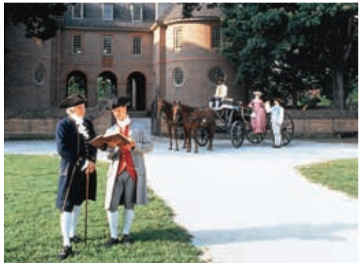
Governor's Palace at Colonial Williamsburg

We travel back to Washington, DC today as our tour ends with a group transfer to Washington Reagan National Airport for flights out after 2:00 p.m. Breakfast