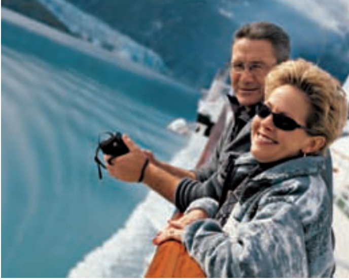
Cruise the majestic waters of Alaska