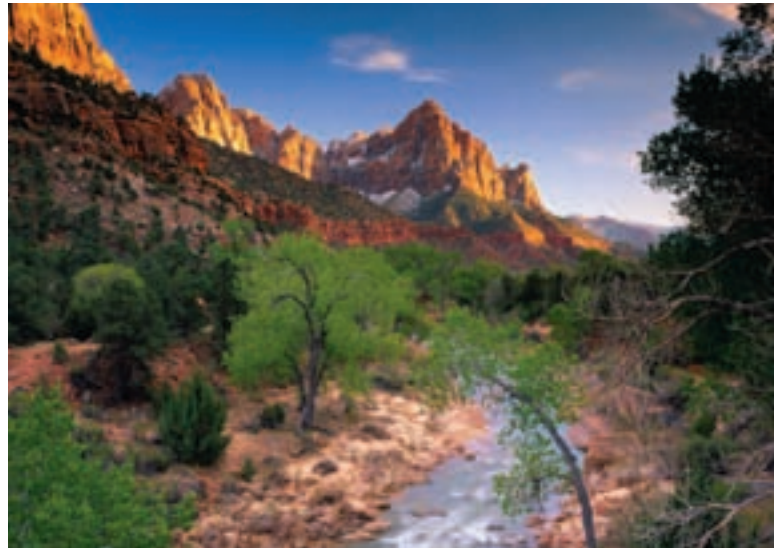
Zion National Park's Virgin River

Depart to Las Vegas McCarran International Airport for flights home departing after 1:00 p.m. Breakfast