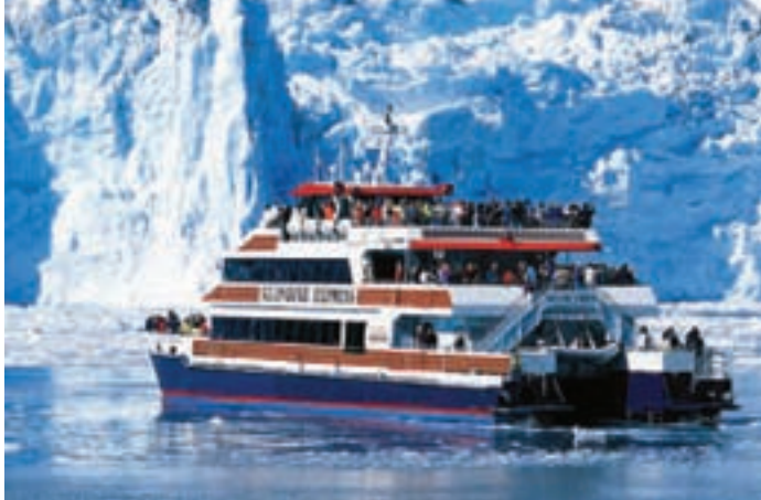
26 Glacier Cruise aboard the Klondike Express

and board the Klondike Express , a high-speed catamaran for an unforgettable cruise of Prince William Sound. The sheltered waters of the Sound offer excellent wildlife viewing. Enjoy lunch while taking in some of the most spectacular scenery in Alaska, including the 26 glaciers which line College and Harriman fjords. Breakfast and lunch