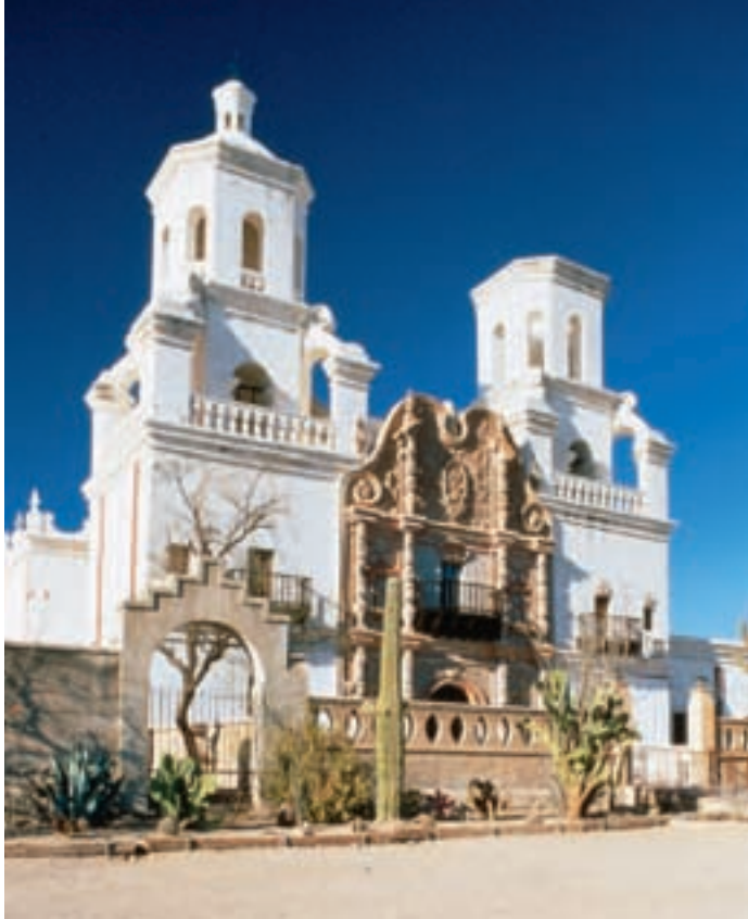
San Xavier del Bac Mission