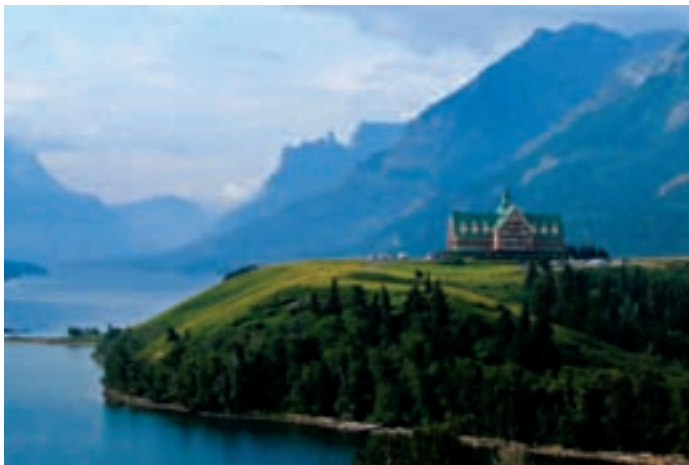
Have lunch at the Prince of Wales Hotel

Browning is headquarters for the Blackfeet Indians and it is here that we visit the Museum of the Plains Indian, a comprehensive collection of cultural artifacts and exhibits. We then travel to Great Falls, the area that held great significance for the Lewis & Clark Expedition. Here we visit the Lewis & Clark Interpretive Center. The explorers