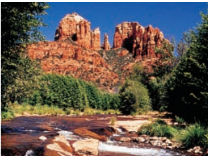
Red Rocks of Sedona

Today is a day filled with miracle and awe. A powerful and inspiring landscape, the Grand Canyon will overwhelm your senses with its immense size and nearly one mile depth. Carved by the Colorado River over millions of years, this breathtaking park features some of the most beautiful vistas on the planet. A stop at Desert View point offers a magnificent view of the Grand Canyon, the Colorado River and the Painted Desert as it meanders off into the distance. Tonight, spend another night in the park with this magnificent natural wonder only steps away. Breakfast