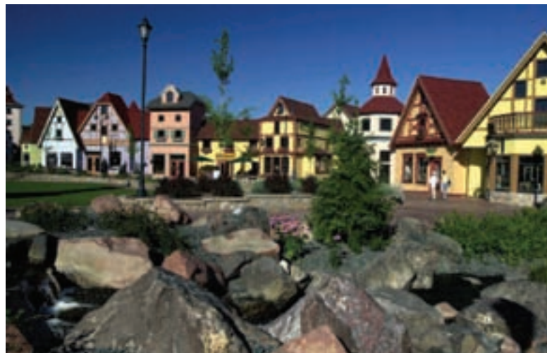
The Bavarian Village of Frankenmuth