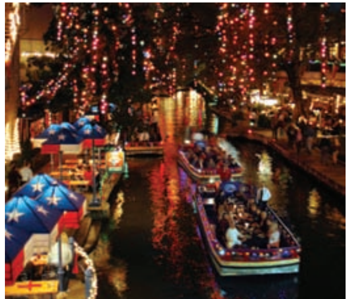
Dinner cruise along the Paseo de Rio

Enjoy your morning at leisure. Your Tour Manager will assist you with transfers to the airport for flights home anytime. Breakfast