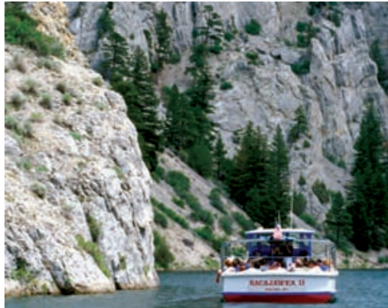
Gates of the Mountain Cruise

We depart this morning from Bozeman to the Billings airport for flights departing after 12 p.m. Breakfast