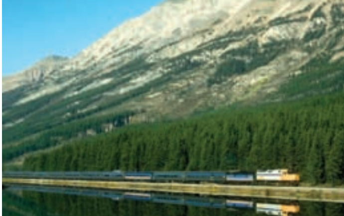
Travel aboard VIA Rail