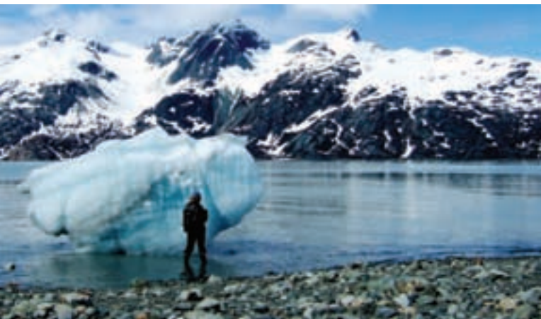
Glacier Bay National Park