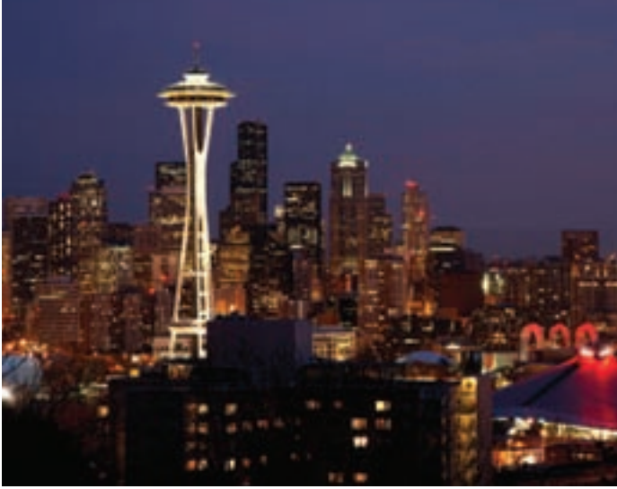
Seattle and the Space Needle