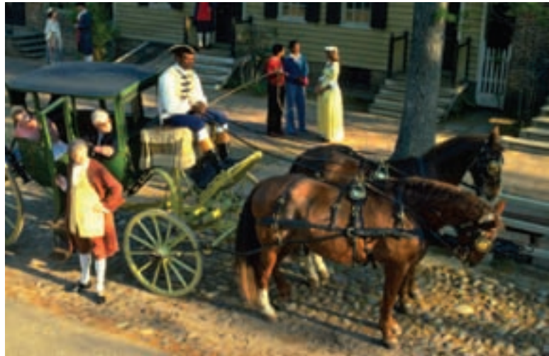
Historic Colonial Williamsburg

We travel back to Washington, DC today as our tour ends with a group transfer to Washington Reagan National Airport for flights out after 2:00 p.m. Breakfast