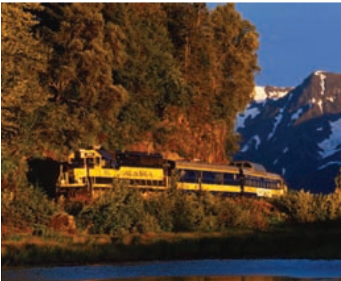
Alaska Railroad negotiating a river curve

Today we board the Alaska Railroad’s flagship The Denali Star for the trip to Denali National Park. The track cuts through the northern boreal forests of the interior on a journey where sparkling salmon streams, stands of aspen and birch and carpets of purple fireweed create a dramatic landscape. Arriving in Denali, the afternoon is free of scheduled activities to enjoy your scenic surrounding and enjoy an optional “flight-seeing” trip on a helicopter through the park, or a river float trip on the Nenana River. Tonight, sample Alaskan cuisine at Alaska Cabin Nite and enjoy an all-you-can-eat Alaska dinner. Then sit back for a hilarious show of tall tales, fun songs and foot-stompin’ music. Breakfast and dinner